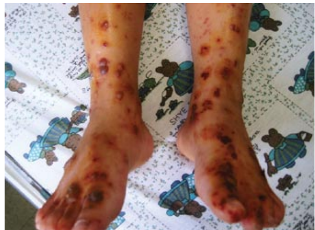
Fig. 1. Hemorrhagic bullae on bilateral feet

fever. Skin rashes and arthralgia developed 2 days later. The rashes presented as palpable purpuric lesions initially, which were distributed on the buttocks and lower extremities. Bullae developed within 3 days. The patient was then admitted to our hospital. On examination, the patient had diffuse purpura over her buttocks and lower extremities. Multiple hemorrhagic bullae in various sizes were located on the base of the pupura (Fig. 1). They ranged in size from 2 to 10 mm in diameter.